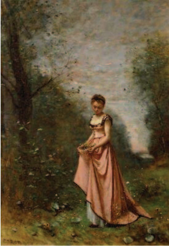
Springtime of Life G357