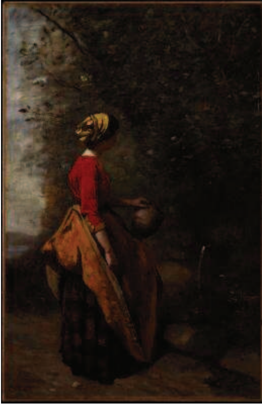
Peasant Girl at the Spring G354