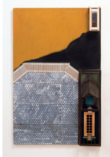
Notation on Gazebos (X), Siah Armajani, 1991, Walker Art Center

"Dictionary for Building: The Garden Gate, "1982-83, Walker Art Center